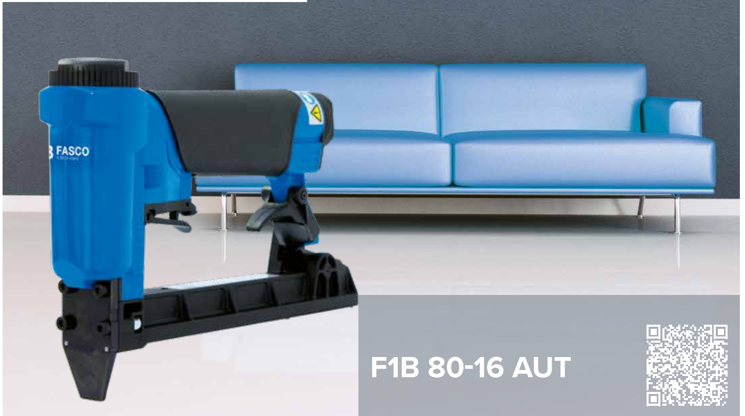
F1B 80-16 AUT