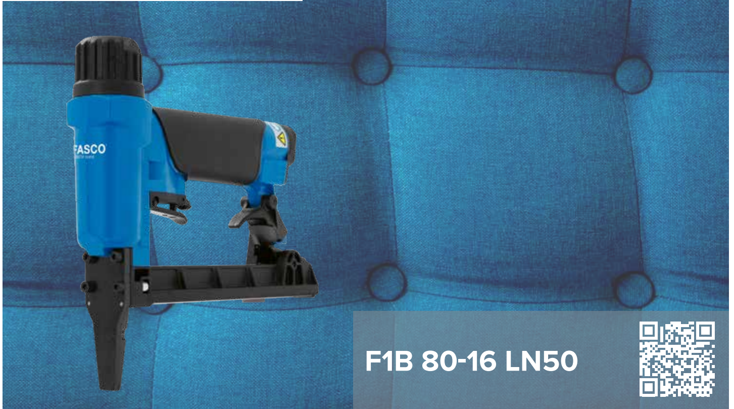
F1B 80-16 LN50